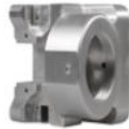
PLANT AND CAPABILITIES