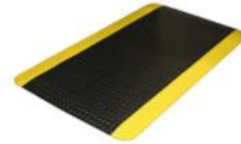
MATting, SIGNAGE, MARKING