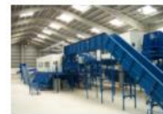
WASTE MANAGEMENT EQUIPMENT