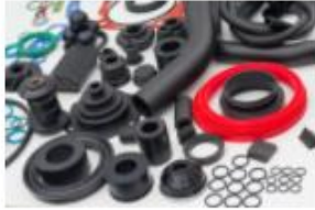
SEALS AND JOINTING