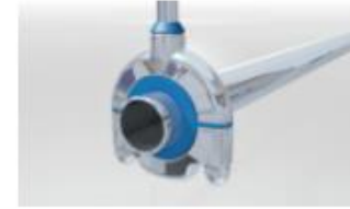
SANITARY GASKETS & FITTINGS